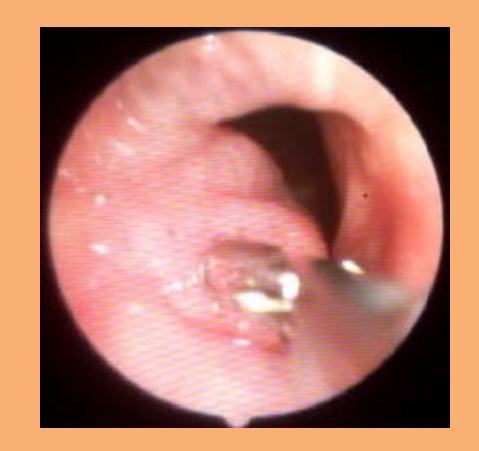
Biopsy & staging of laryngeal cancer