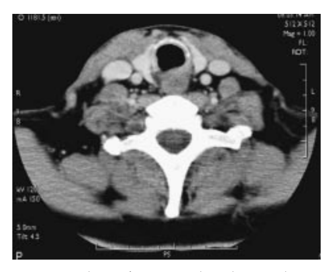
Figure 1 Axial view of a contrast-enhanced computed tomographic scan through the level of the cricoid cartilage. Note the isointense mass involving the posterior wall of the cricoid cartilage and the esophagus.

Pathologic examination of the subglottic lesion was reported as squamous mucosa with focal acute and severe chronic nonspecific inflammation of the stroma with significant eosinophilia. There was no evidence of malignancy, vasculitis, necrosis, or granuloma. Special stains were negative for microorganisms. Esophageal